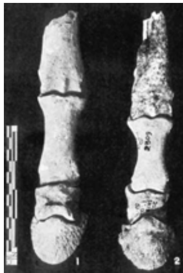
Fig. 1: Horse bones from Surkotada (in Katchchh)