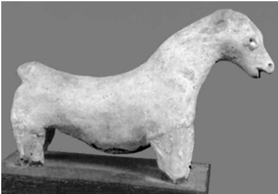
Fig. 2: Horse figurine from Mohenjo-daro.

Perhaps the most interesting of the model animals is one that I personally take to represent a horse. I do not think we need be particularly surprised if it should be proved that the horse existed thus early at Mohenjo-daro. 27