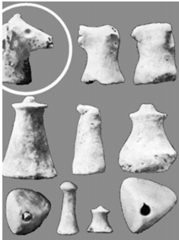
Fig. 4: A horse-like figurine from Lothal (circled, as part of a set of "chessmen")

It is not just the horse that invasionist scholars sought to erase from pre-1500 BC India: they also asserted that the spoked wheel came to India only with the Aryans. 32 "The first appearance of [the invading Aryans'] thundering