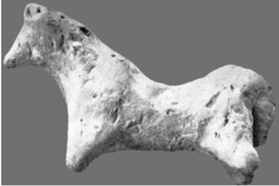
Fig. 3: Horse figurine from Lothal